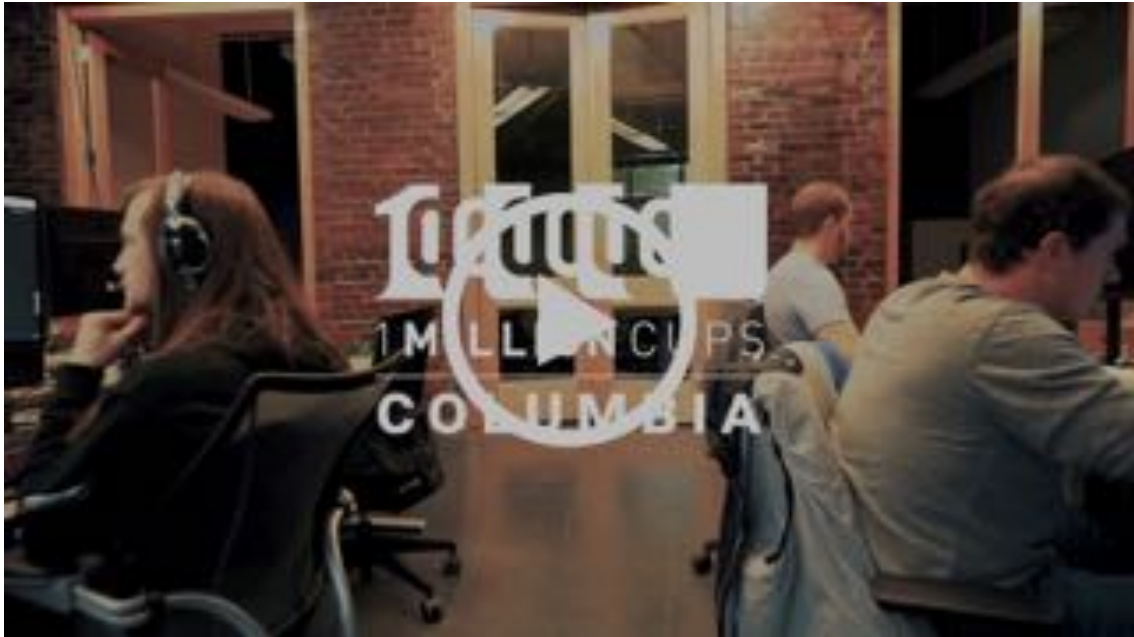
Celebrate Global Entrepreneurship Week with 1 Million Cups and SOCO this Wednesday, 11/20