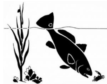
North Inlet-Winyah Bay National Estuarine Research Reserve